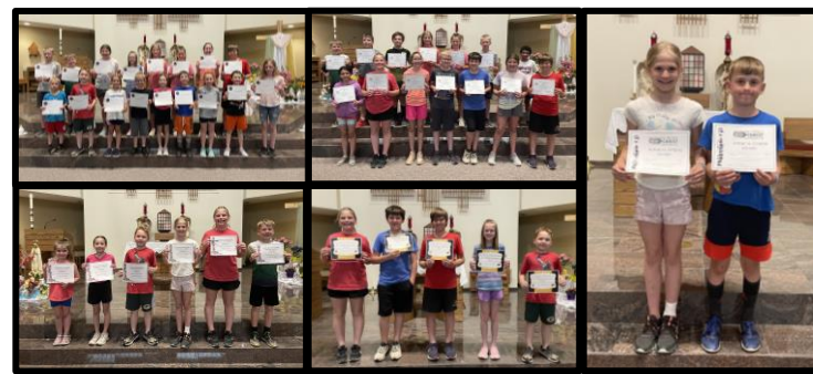
Pictures of all award winners can be found on Facebook @StPetersCanby or at www.schoolofstpeter.com .

“Catholic teaching and values are integrated into all areas of the curriculum...”